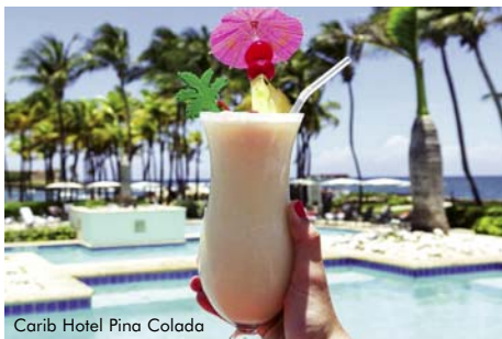
Carib Hotel Pina Colada

If you're a fan of the reality TV series "Love is Blind," you'll get an intimate insider peek at this swanky adults-only resort called TRS Turquesa in the Dominican Republic. They