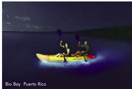
Bio Bay Puerto Rico