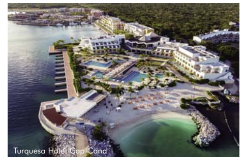
Turquesa Hotel Cap Cana